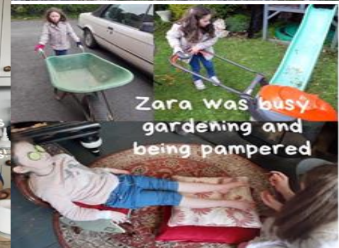
Zara was busy gardening and being pampered