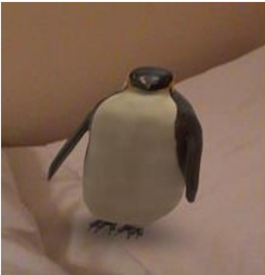
This little guy was sitting on my bed!