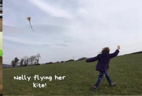
Nelly flying her kite!