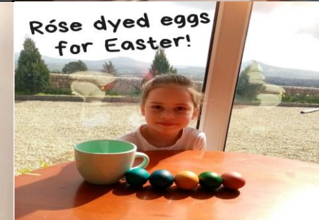
Róse dyed eggs for Easter!