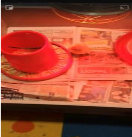
Snowflake in his new home waiting for his brother and sisters to arrive.